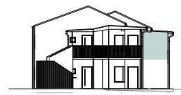
FASAD MOT NORR