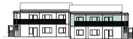
FASAD MOT VÄSTER